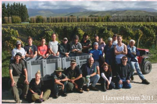
Harvest team 2011