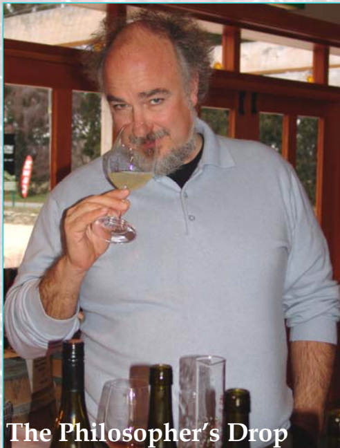
The Philosopher's Drop