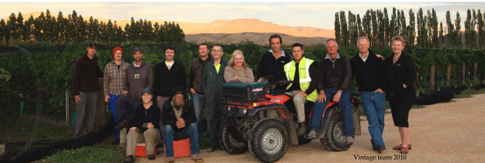
Vintage team 2010